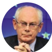
HERMAN VAN ROMPUY President of the European Policy Centre and President Emeritus of the European Council