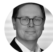
Fabian Raschke Grünenthal GmbH