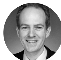
Axel Paix Brenntag SE